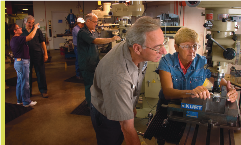
RCBI boasts a job placement rate of 90 percent, a great advantage for its diverse students.